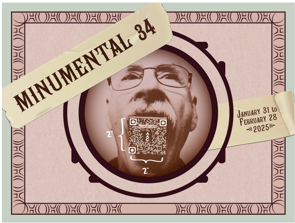
Minumental 34 promotional designs by Lycia Cromer